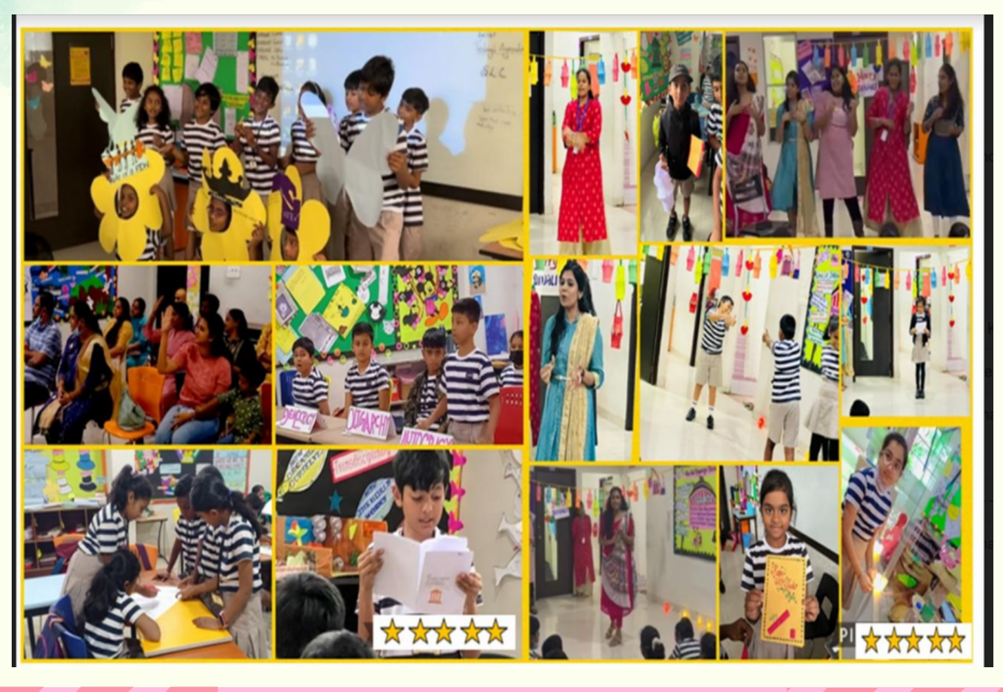
"Little moments create great memories"